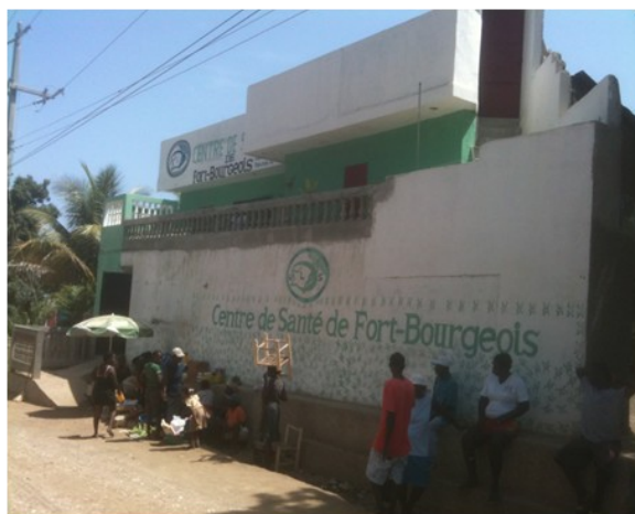
ULS Clinic in Ft. Bourgeois