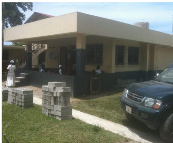
Family Clinic in Bayeaux